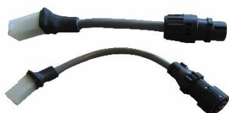
Club Car Adapter Cable 62-1313K-CC E-Z-GO Adapter Cable 62-1313K-EZ